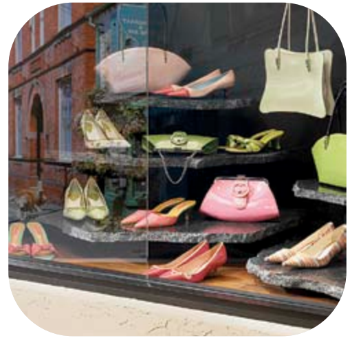
Comparison between Pilkington Optifloat™ Clear (left) and Pilkington OptiView™ (right)